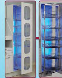
Pull-Out Rotating Soft-Closing Instrument Tower w/Light

Standard E-120 Overall Dimensions: 119-1/4" (L) x 84" (H) x 27-3/8" (D) * 3" Wrap Drawers in Autoclave Tower Do Not Have this Feature