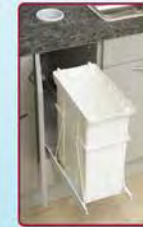
Pull-Out Waste Container