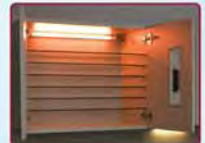
Instrument Cabinet w/ Glass Shelves and Light