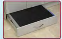
Autoclave Tower Slide-Out Platform