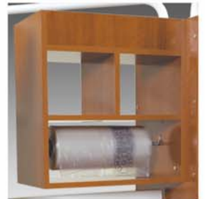
92-183 X-Ray End Section Upper End Storage ▼