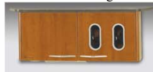
E-2L Lower Storage ▼