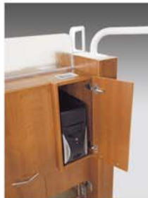
92-938 Vent Grill for CPU Storage ▼