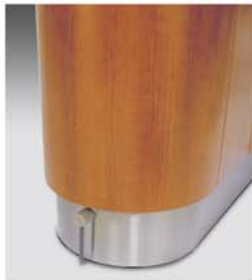
92-601 Manual Faucet with Euro-Style Tapmaster ▼