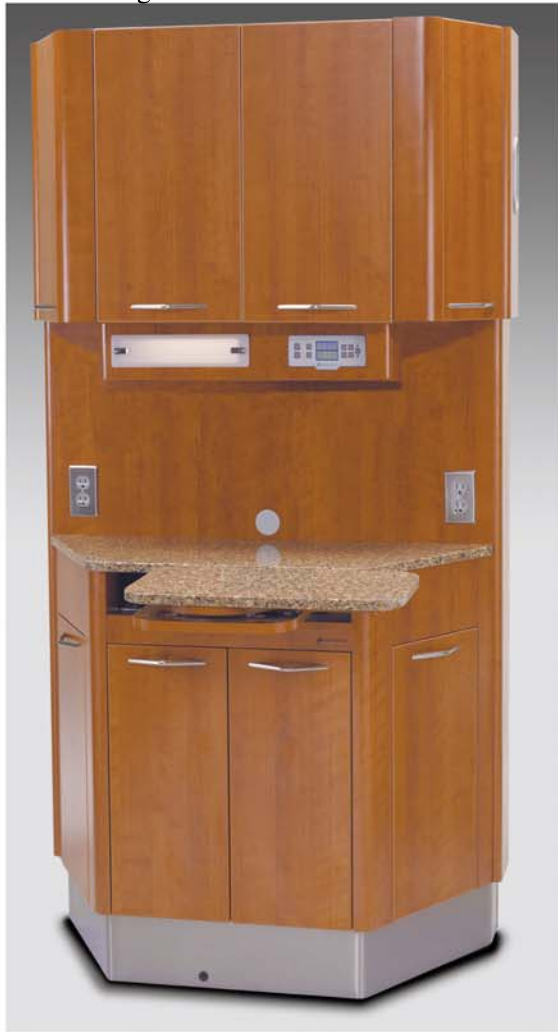
E-6 Left-Right Rear Treatment Console ▼