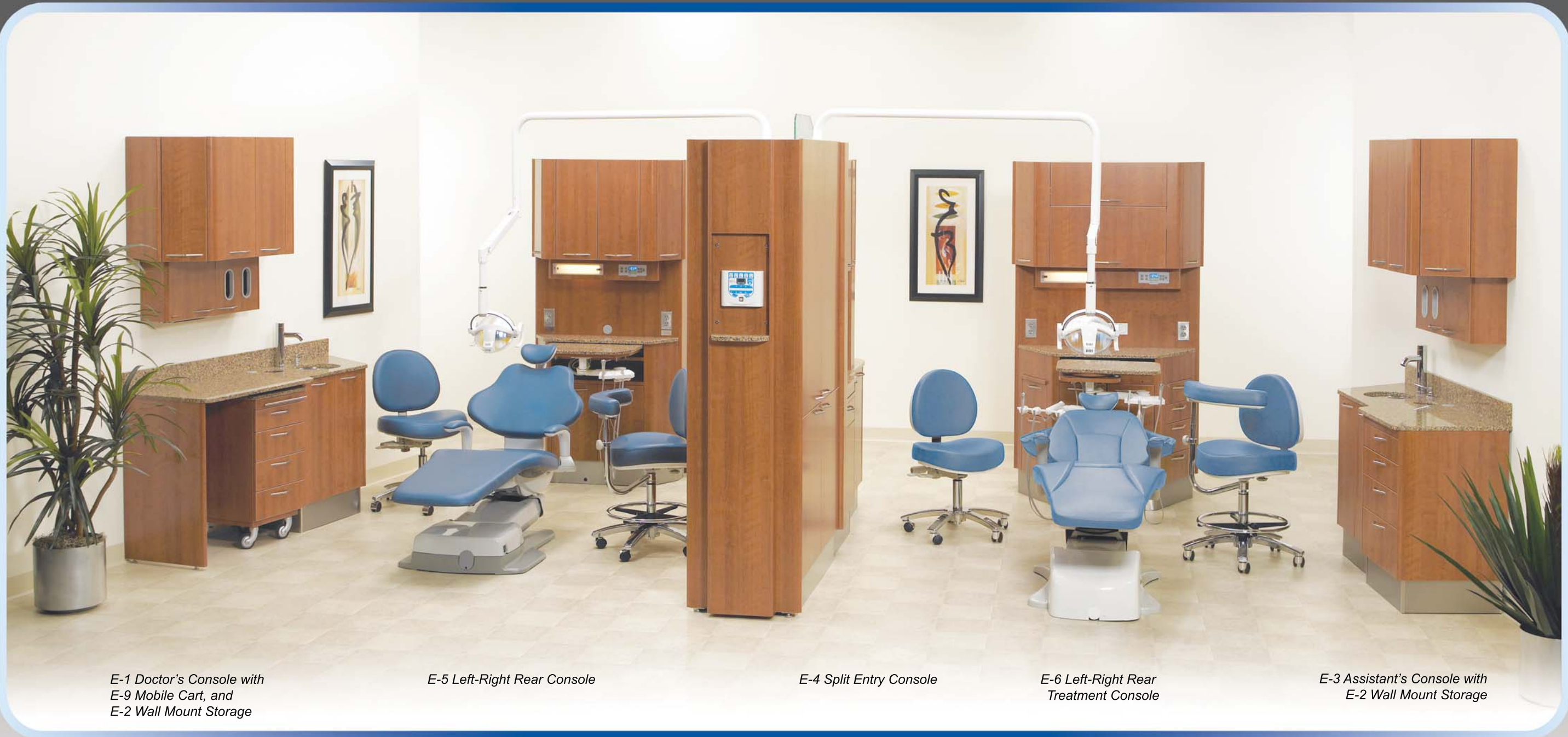
E-1 Doctor's Console with E-9 Mobile Cart, and E-2 Wall Mount Storage