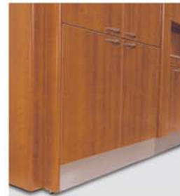
92-176 or 92-177 (bi-fold) X-Ray End Section Module Storage ▼