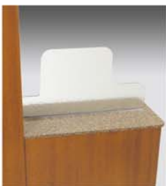
92-187 X-Ray End Section Privacy Glass Partition ▼