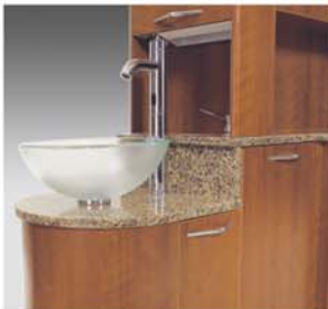
E-4G Glass Bowl Unit ▼