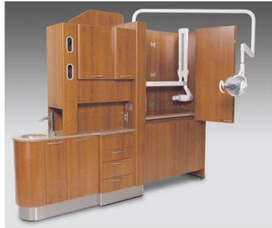
E-4 Assistant's Side Shown with 92-092 Bi-Fold Doors PHOT-xII X-Ray and Clesta Lights ▼