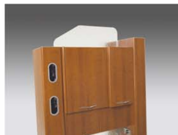
92-184 Upper Glass Partition ▼