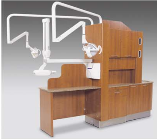
E-4 Doctor's Side Shown with PHOT-xII X-Ray and Clesta Lights ▼