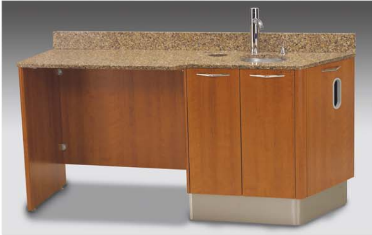
E-1 Doctor's Side Console ▼