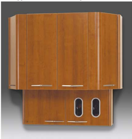
E-2 Upper Wall Mount Storage Unit ▼