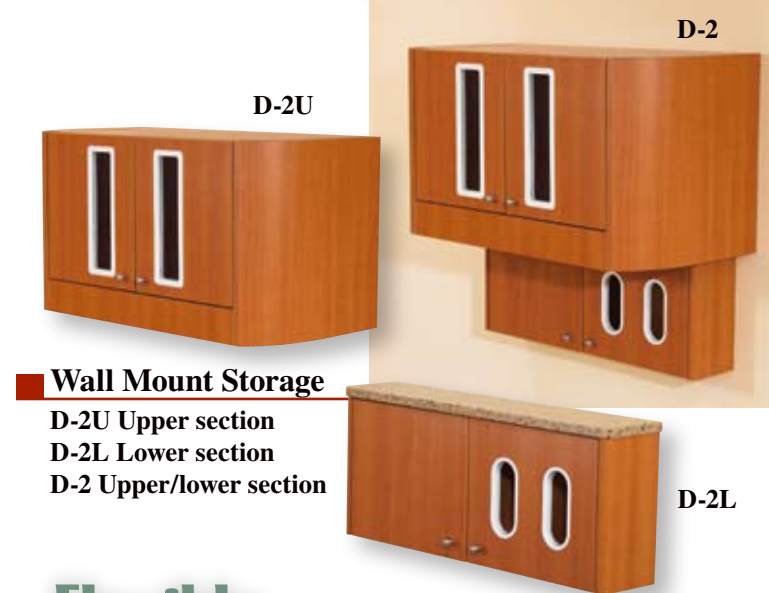
Wall Mount Storage D-2U Upper section D-2L Lower section D-2 Upper/lower section