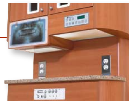
Task light diffuser panel eliminates shadows.