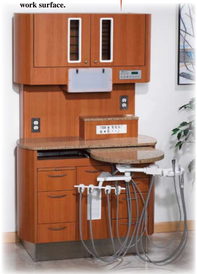
D-66CM The D-66CM shown with BDS-2561 unit mounted to multi-directional sliding work surface.