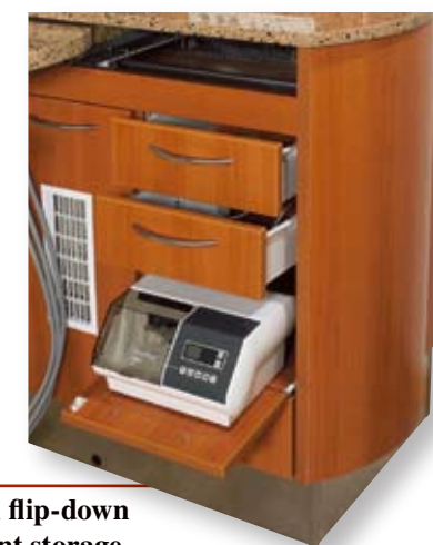
Optional flip-down equipment storage.