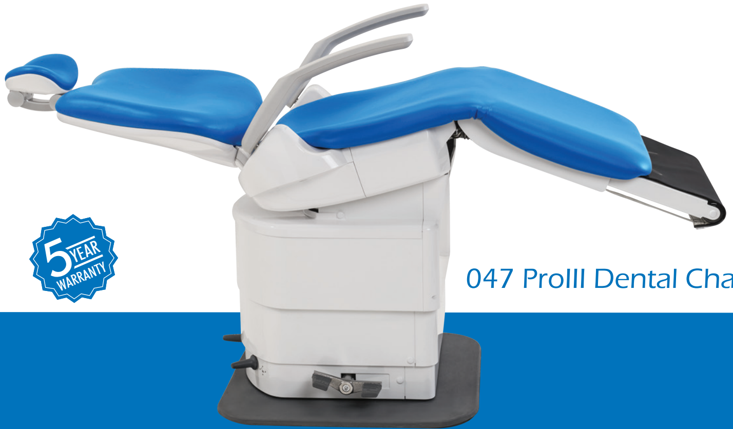
047 ProIII Dental Chair