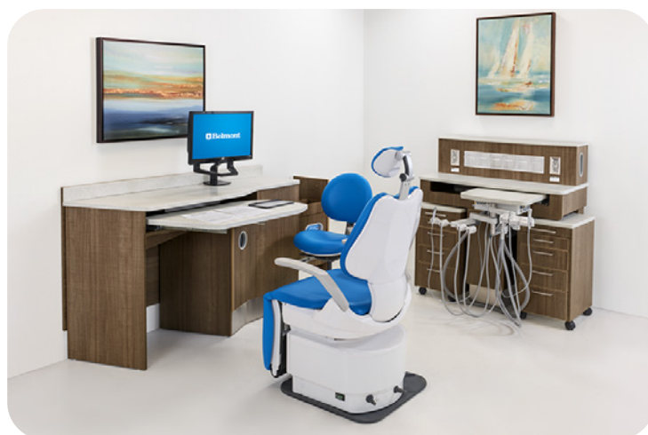
Consultation & Education