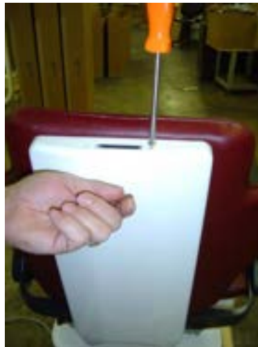
12. Attach plastic backrest cover to chair. Insert wood screws into holes on top of cover and tighten with a Phillips screwdriver.