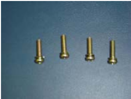
9. Phillips head screws with lock washers.