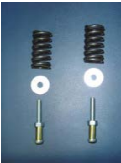
3. Arm rest screws/ washers/ compression springs