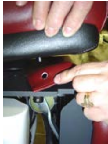
20. Align legrest cushion flap holes with the through holes on the front of the metal seat plate, as shown.