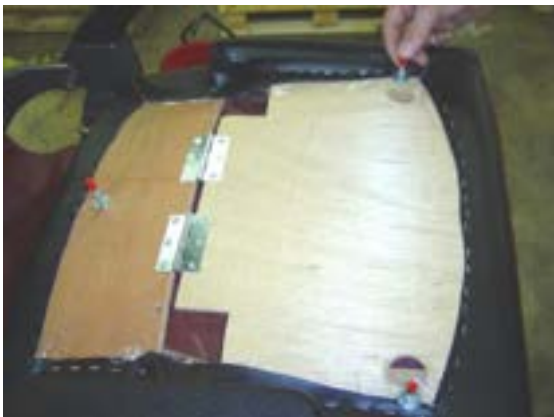
17. Remove red plastic caps from bottom of seat cushion & discard.