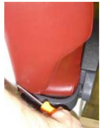
13. Insert machine screws into side holes on the lower portion of the backrest cover and tighten with a Phillips screwdriver