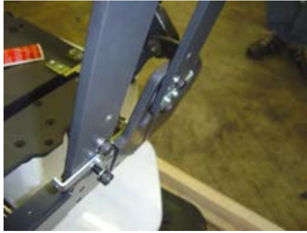
7. Attach backrest support plates to chair using cap screws and split ring washers.