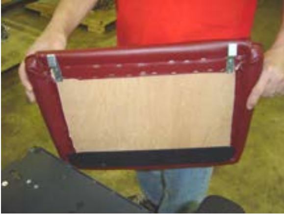
14. Position legrest cushion as shown, with the hooks along the top edge of the cushion, Velcro™ strip at the bottom.