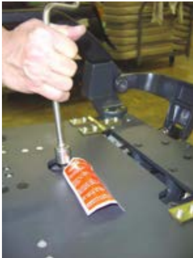
1. Remove tagged red shipping bolt with 11/16" socket wrench.