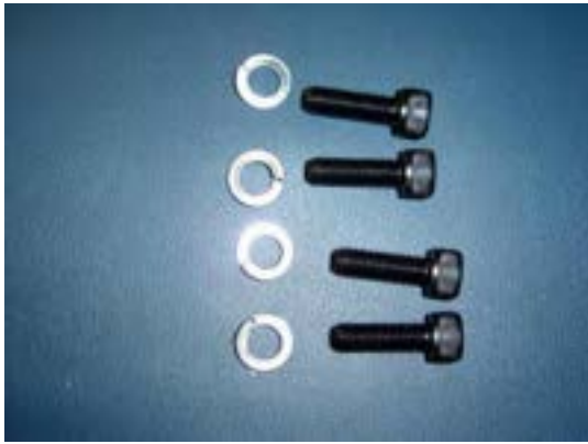
6. Cap screws and split ring washers