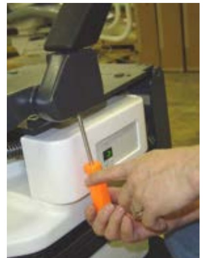
5. Tighten screw with a Phillips head screwdriver.