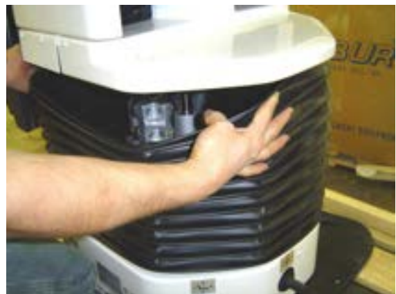
24. Attach the bellows to plastic seat cover. Tuck the upper end of the bellows inside of the lower edge of the cover.