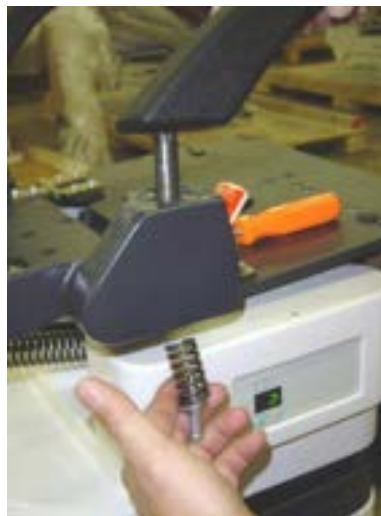
4. Insert armrest into the top of the armrest bracket. Insert washer and spring over screw, then insert into the bottom of the armrest bracket.