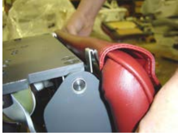
15. Slide cushion downward, hooking legrest cushion on to the legrest frame. Press cushion against frame to engage Velcro™. Note: fold upholstery flap forward while attaching cushion and back over seat plate when procedure has been completed.