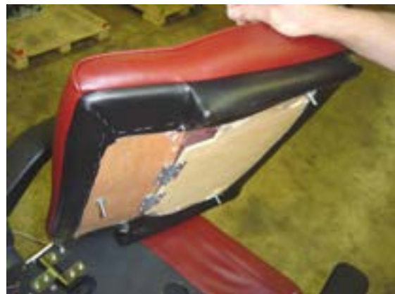
18. Flip cushion over and position with 2 screws in front, and 1 screw toward the backrest.