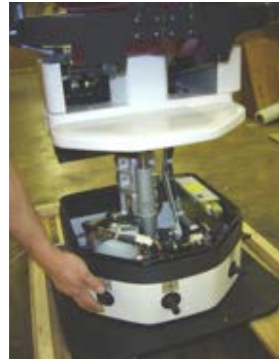
2. Plug chair power cord into an electrical outlet and raise chair base.