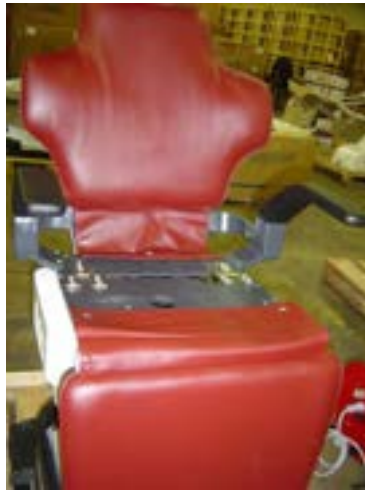
16. Chair with backrest & legrest upholstery attached. Note positioning of backrest and legrest flaps for next steps.