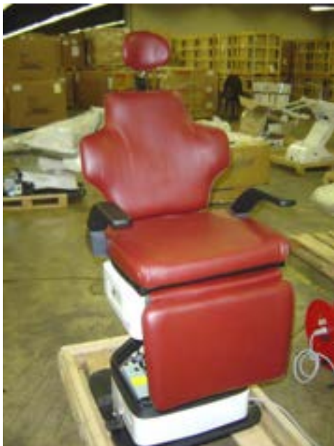
23. Chair with completed upholstery installation