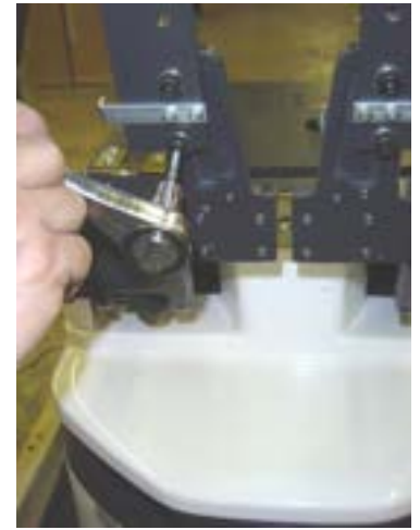
8. Tighten cap screws using a 6mm hex key wrench.