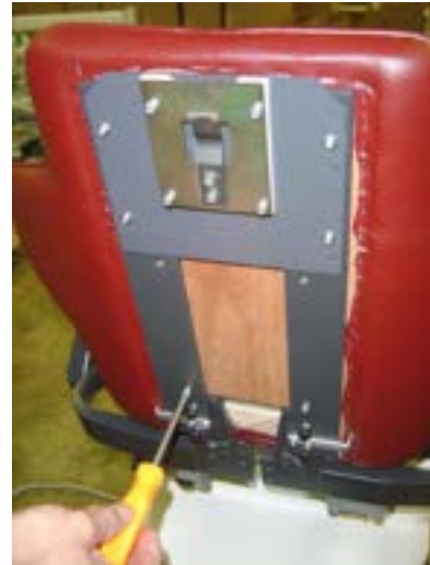
10. Attach backrest to backrest support plates with Phillips head screws.