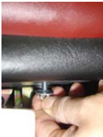
21. Install seat cushion. Add washers and hex nuts. Tighten nuts with small adjustable wrench.