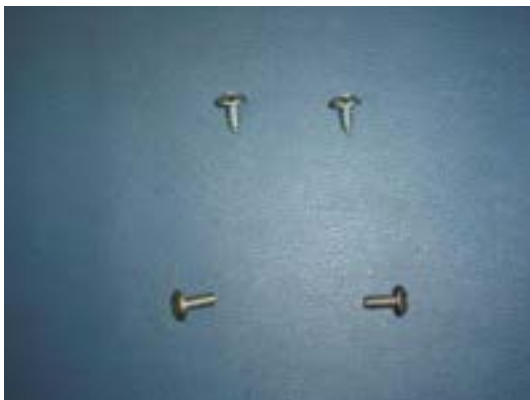
11. Phillips head wood screws & Phillips head machine screws