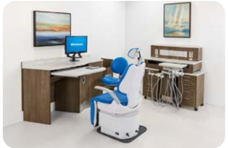
Consultation & Education