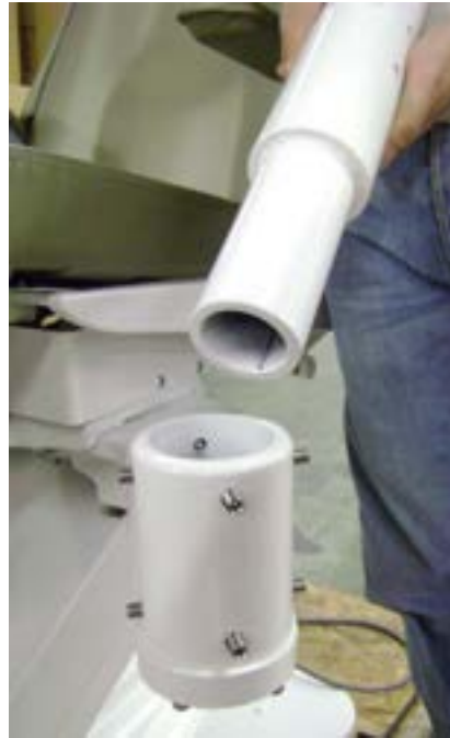
Unit mounting post insertion into the hub of the chair adapter.