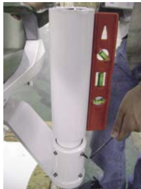
Repeat leveling with Bubble Level placed at 90° to original position, then tighten hub set screws.