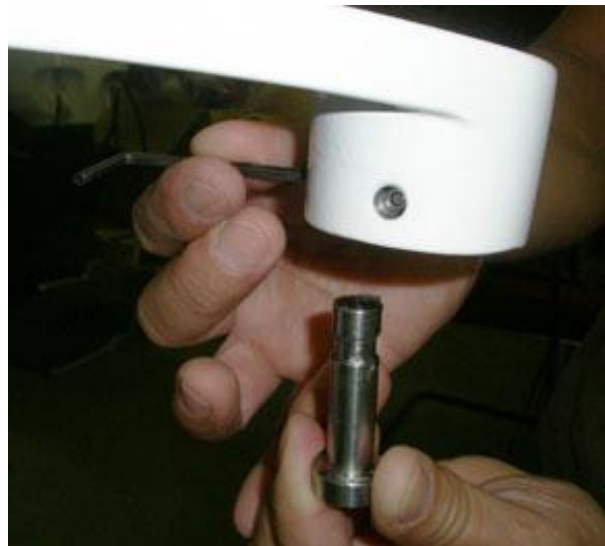
Remove the Pivot Pin by loosening the (2) setscrews with a 3mm hex key wrench.