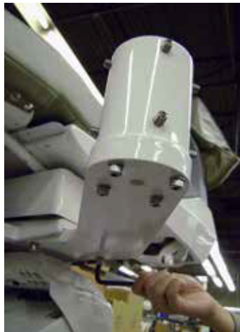
Side Mounted Adapter with Hub, For Attaching OTP units and Cuspids to X-Calibur Series Chairs