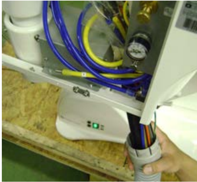
Upper umbilical snaps into the bottom of the PMU frame.