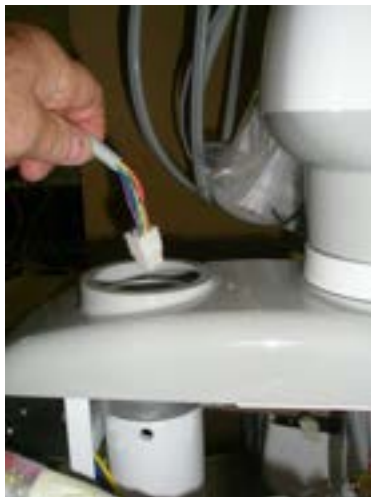
Inserting the upper umbilical from the Dr. Table/ Arm assembly into the top of the unit mounting post.