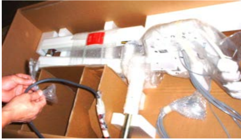
Removing bag of tubing collars from the umbilical prior to insertion into the PMU