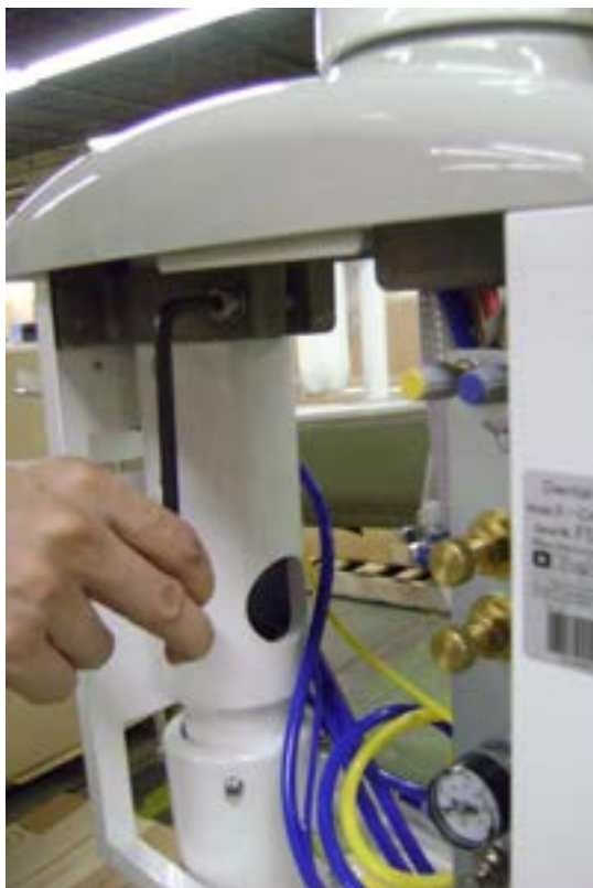
Tightening the PMU mounting clamp to the unit mounting post.

5) Loosen PMU mounting clamp bolt with a 6mm hex key wrench, then hang the PMU onto the unit mounting post with the water system end toward the toe end of the chair. Set the PMU at the desired height and re-tighten the clamp bolt with a 6mm hex key wrench.