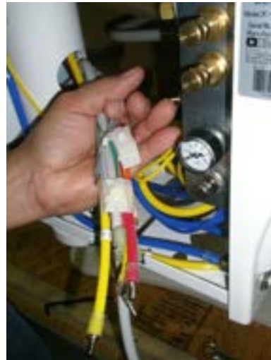
Pulling the upper umbilical tubing into the PMU.