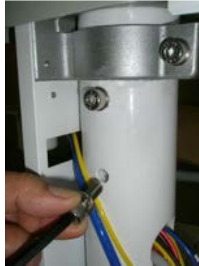
Inserting the socket cap screws to secure the arm assembly to the unit mounting post.