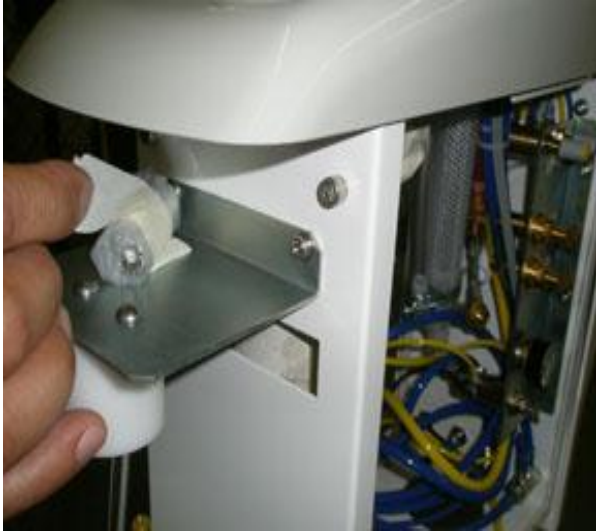
Socket cap screws are taped to the top of the water system bracket prior to shipment from the factory.