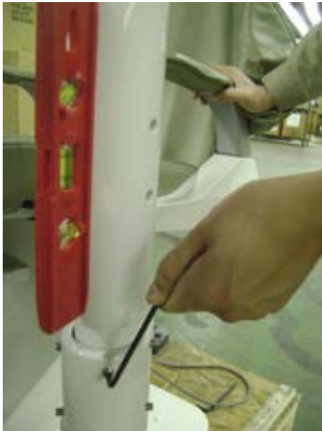
Leveling the unit mounting post with a Bubble Level.