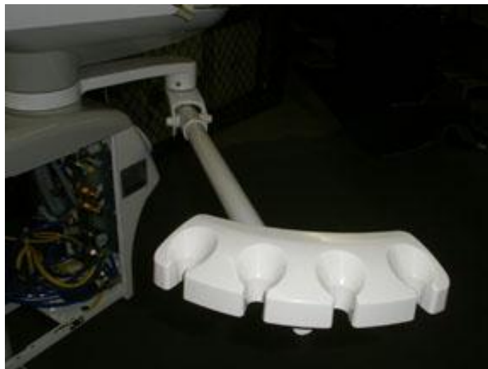
The telescoping arm assembly attached to the PMU section