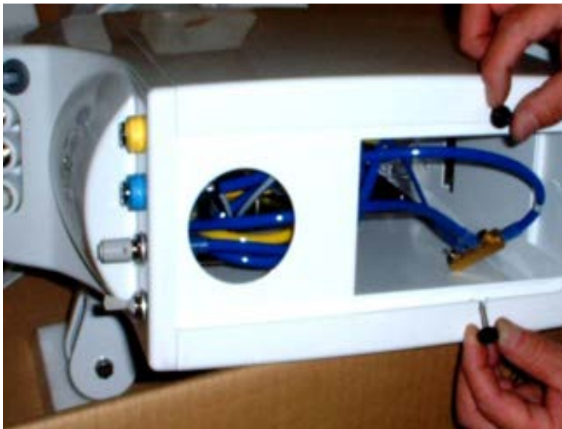
Removing the thumbscrews from the bottom of the PMU.

4) Remove the 2 thumbscrews from the bottom of the PMU. Remove PMU side cover.