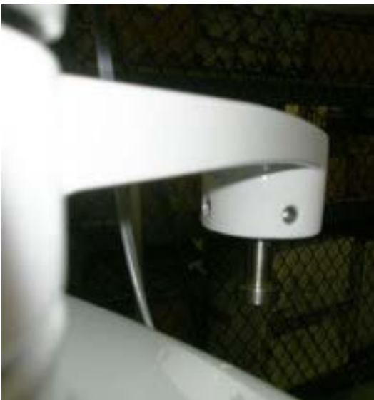
The assistant Rotation Bracket is shipped with the Pivot Pin retained by (2) setscrews.