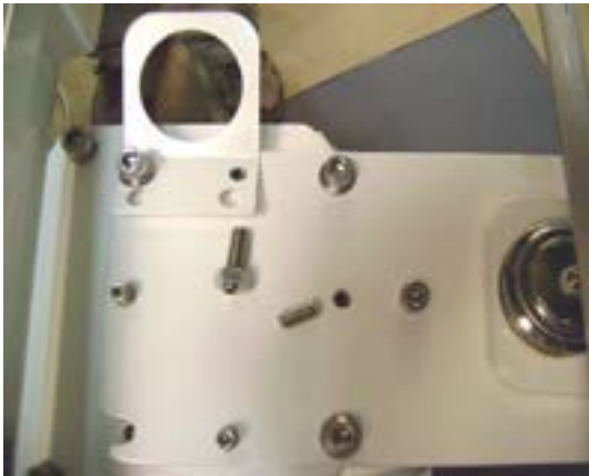
Bracket for Umbilical Hose is secured using socket bolt with spring washer and flat washer. Note: M10 x 20 leveling set screws & M10 x 35 leveling set screw with nut shown.

Place the Bracket for umbilical hose on top of the Swing Arm Rotation Plate and align the back/inside hole with threaded hole of Chair Mounting Plate underneath the slotted end of the Rotation Plate. Add 10mm x 40mm socket bolt with 10mm spring washer and 10 mm flat washer. Add remaining bolt/split ring washer/ flat washer to secure other slotted end of rotation plate. Use an 8 mm wrench to partially tighten assembly.