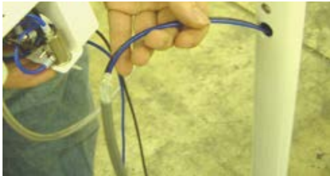
Insert 1/8" blue & brown tubing into the hole on the side of the swing arm and feed tubing down through bottom end of the Swing Arm