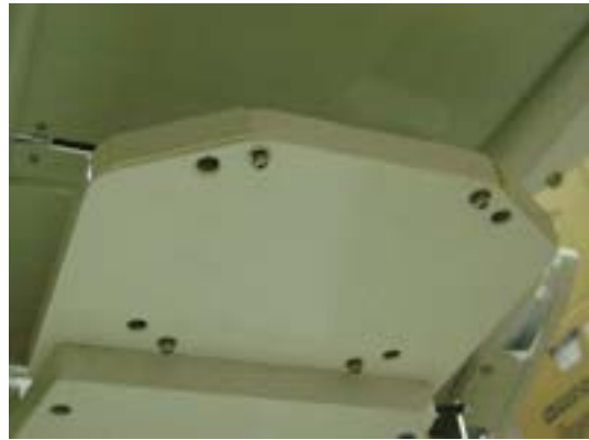
Attached mounting plate, shown from below. Note (4) 4mm x 10mm Phillips screw heads face down. (These are used for mounting sensor/switch box, if light swing arm is added at a later date)