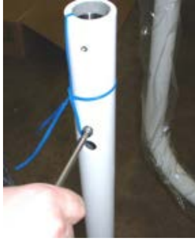
Use Phillips screw driver to remove 6mm x 20mm water bracket mounting screw