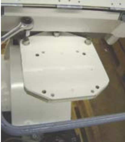
Chair Mounting Plate is attached on top of the gray extension casting on X-Calibur Series chairs

Attach Plate to chair using a 10 mm hex key wrench to tighten the (3) 12mm x 55 mm socket bolts with 12mm spring washers.