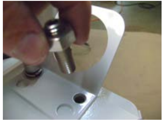
Insert long (35mm) leveling set screw with locking nut through hole in Umbilical Mounting Bracket, as shown above. Nut should be tightened after final leveling of swing arms & unit.