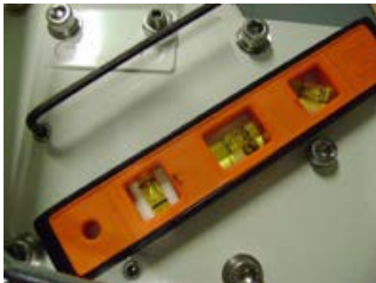
Adjusting (4) set screws for leveling of Swing Arm Assembly

Final leveling of Swing Arm Assembly should be repeated and adjusted after Doctor Table/ Balance Arm Assembly has been attached to the Swing Arm Assembly in step 7.